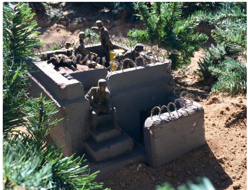
Topping of concrete bunker walls