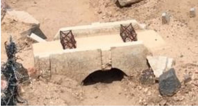
Bridge Barricades (soldered brass strips w/ wire wrapped around).

L. Examples of how we used barbed wire on the FRAG Battlefield.