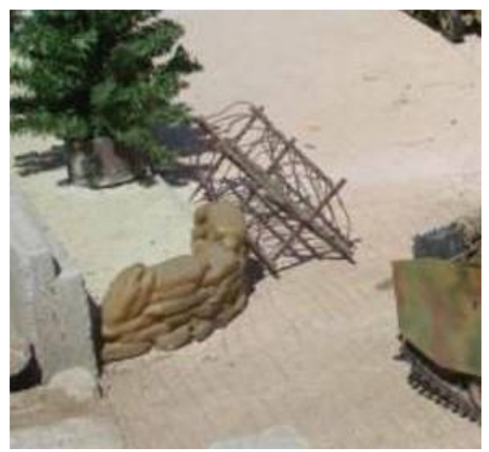
Also as street Barricades (this frame was made from wood sticks).