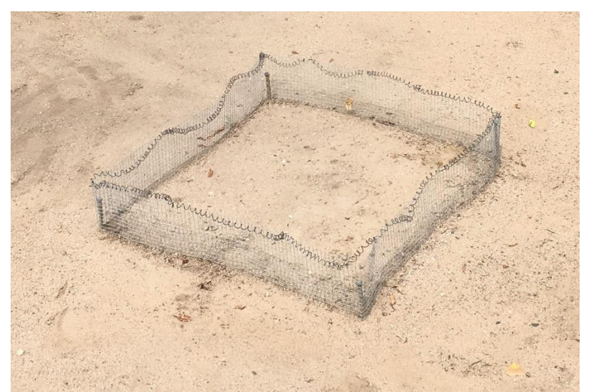
Top of POW Fence